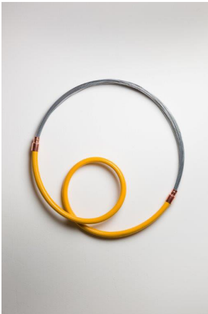
Infinity Yellow , 2013, Mixed media, 50 x 50 cm

For more information please contact Rebekah Standing at Belmacz: rebekah@belmacz.com or call +44 (0)20 7629 7863