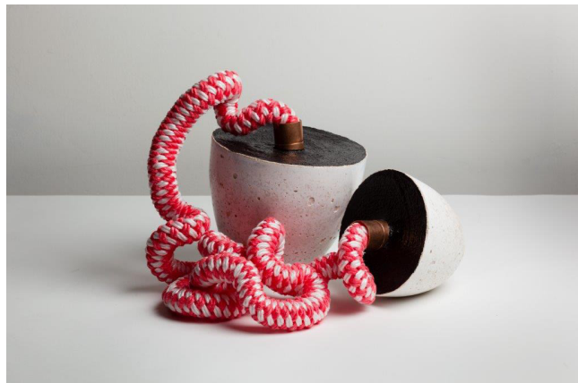
Two Halves , 2013, Mixed media, Dimensions varied