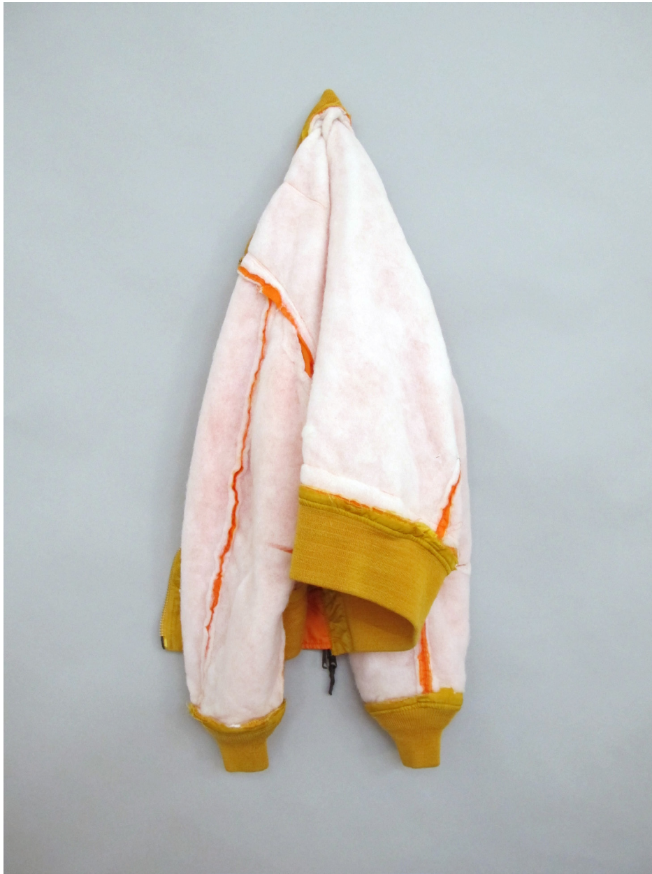
Simon Mullan, Yellow Naked Bombers , 2014

The series Naked Bomber Jackets are not for sale.